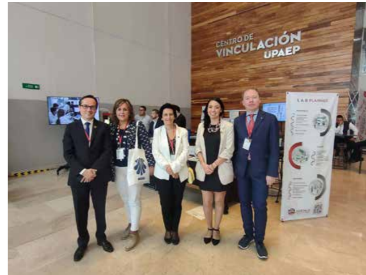
Meeting with representatives of the Popular Autonomous University of the State of Puebla-UPAEP, Mexico.