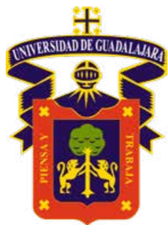
University of Guadalajara (MEXICO)