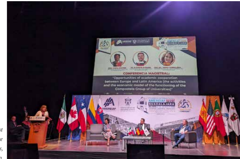
Participation as guest speaker at the AMERELAF congress, Guadalajara, Mexico.