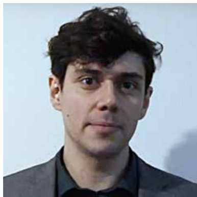
1 st Prize

The jury, composed of researchers from the University of A Coruña (Spain) and University La Salle Bajío (Mexico) under the leadership of our president, did not have an easy task as this edition was one of the most competitive so far. A total of 42 pitches were received for the contest from 36 different research departments of 13 member universities.