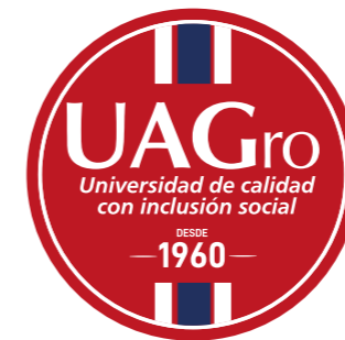
AUTONOMOUS UNIVERSITY OF GUERRERO