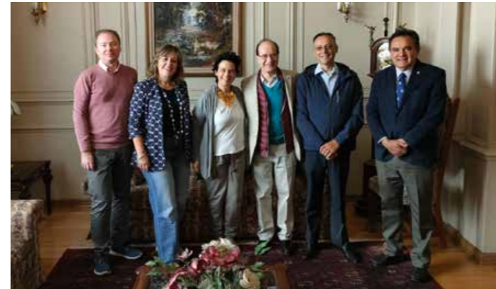
Visits to our La Salle member Universities in Mexico City, Mexico