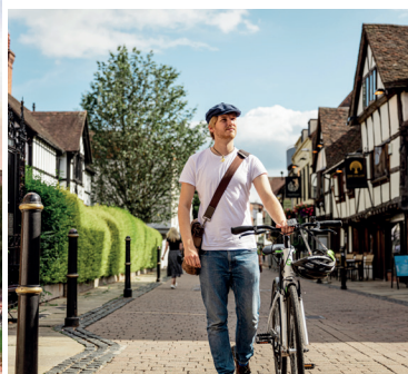
Worcester and surrounding area Malvern Hills; Worcester Cathedral; Tudor buildings along Friar Street